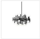
CH96128-BL Black Plating